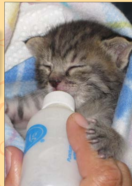
Wally, a four week old kitten, being bottle fed.

Closed Labor Day, Monday, Sept. 5 Thanksgiving Day, Thursday, Nov. 24, Christmas Eve, Saturday, December 24, Christmas Day, Sunday, December 25, New Year's Eve, Saturday, December 31, & New Year's Day, Sunday, January 1, 2012 120 Aberdeen Ave., Cardiff-by-the-Sea (760) 753-0970